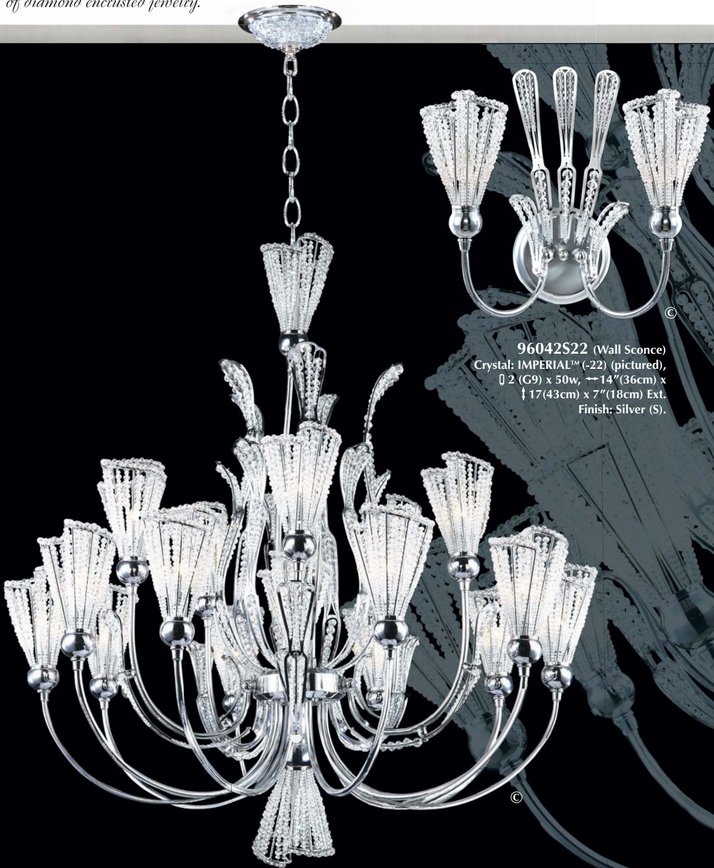
96042S22 (Wall Sconce) Crystal: IMPERIAL™ (-22) (pictured), □ 2 (G9) x 50w, ↔ 14"(36cm) x ‡ 17(43cm) x 7"(18cm) Ext. Finish: Silver (S).

As the name implies, this beautifully designed combination of Crystal and Silver finish is inspired by the appearance and appeal of diamond encrusted jewelry.